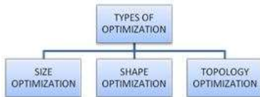
Fig: 2 Types of Optimization

problems and the results are calculated. But if these design parameters does not follow the linear relationship then the problem is treated as non-linear programming problem and then we require a set of procedures for the design criteria to be followed and through these procedures the optimum solutions are obtained.